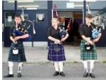
Awards Ceremonies—" a positive ethos in the school"

It is with great delight that I make my first contribution to the Stranraer Academy newsletter. Having only been here a week at the time of writing, I'm still finding my way around the school. I must say, however, that I've been impressed by the openness of the pupils and their willingness to talk to me about a number of topics during lunch-time and interval as I walk about the school. I attended my first School Board / Parent Council meeting last week and found the parents friendly with the same desire as me to continue to improve the school. On that subject, we've received a letter telling us that HMle will return to the school for their follow-up visit at the end of September or early October. Hopefully they will be pleased with the progress made.