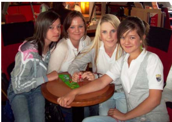
2nd Year pupils on the way to Belfast.

The day started off pretty bleak with grey clouds overhead, soggy socks and Mr.Spratt, but it didn't dampen our spirits en route to Belfast Zoo. The journey there was enjoyable in itself; playing cards, eating sweets and singing cheesy pop songs in the glorious disharmony of breaking adolescent voices realizing they couldn't quite make that note. This amused a number of other passengers on board as you can imagine.