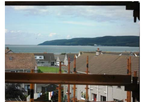
Art rooms in the new building will have views over Loch Ryan.

PROGRESS UPDATE —we expect to be in the new building by January with all work completed on the site by next summer.